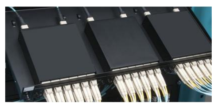
FAS-NET MPO Modular Sliding Patch Panel 1U

FAS-NET MPO Adapter Plates are a modular solution which allows a maximum of 24 MTP Connectors in 1U space. These can be individually fixed by the locking latches on each plate. Each Adapter Plate can accommodate up to eight FAS-NET MPO Trunk Cables.