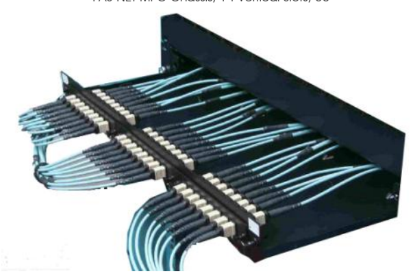
FAS-NET MPO Modular Sliding Patch Panel 1U wth MTP Adapter Plates