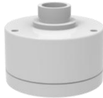
Junction Box IBBBCM-100