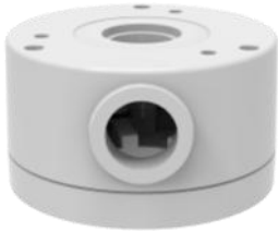
Junction Box IBBWM-100