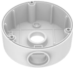
Junction Box IBDWM-115