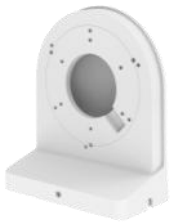
L Bracket IBDLWM-3