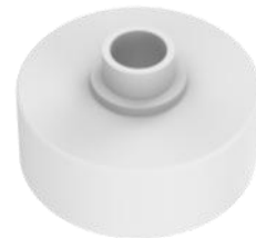
Junction Box IJBDCM-115