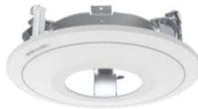
Ceiling Bracket IBDCFM-1