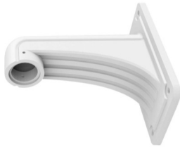
Wall Bracket IBKTWM