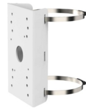
Pole Bracket IBBCPM