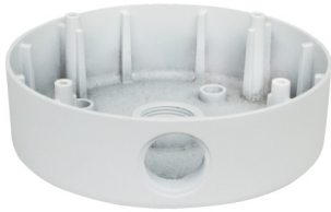
Junction Box IJDWM-146