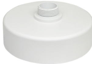
Junction Box IJBBCM-146