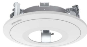
Ceiling Bracket IBDCFM-2