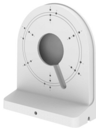
L Bracket IBDLWM-2