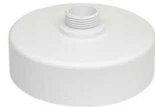
Junction Box IBBBCM-146