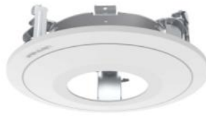
Ceiling Bracket IBDCF-2