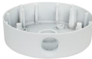
Junction Box IBDWM-146