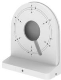
L Bracket IBDLWM-2