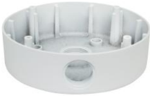
Junction Box IBDWM-146