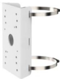
Pole Bracket IBBCPM