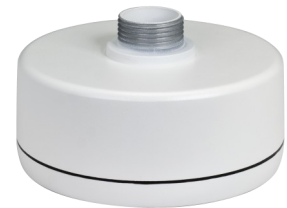
Junction Box IBBBCM-134