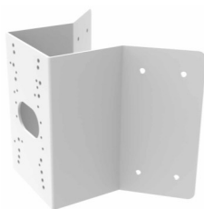
Corner Bracket IBCRWM