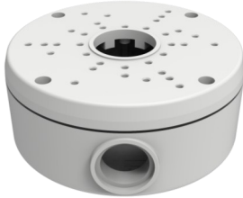
Junction Box IBBWM-134