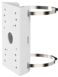
Pole Bracket IBBCPM