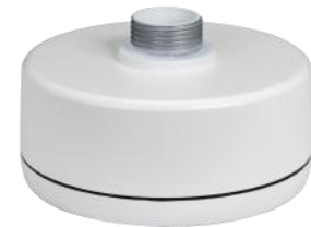
Junction Box IBBBCM-134