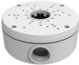
Junction Box IBBWM-134