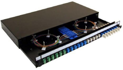
IFRMPP24SCS Fiber Patch Panel with 24 Ports SC Simplex