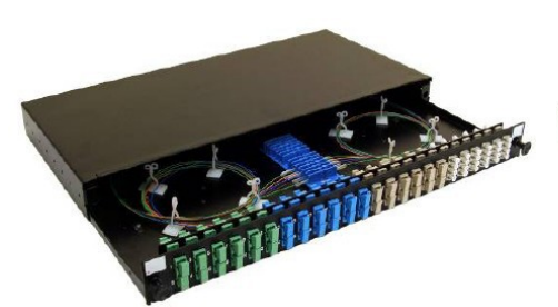
IFRMPP24SCD Fiber Patch Panel with 24 Port SC Duplex